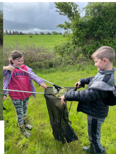
Pupils from St. Cuthbert's, Wigton exploring and discussing biodiversity, litter-picking and (bottom centre) tree-planting