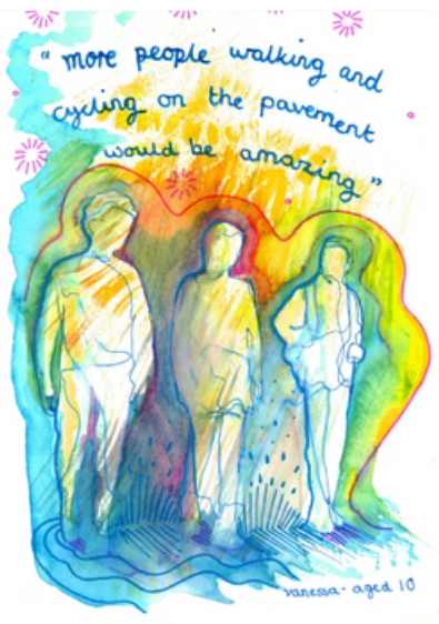
Illustration by Ayeisha Muir- creative notetaker at the Youth Climate Summit ayeishamuir.grillust.uk