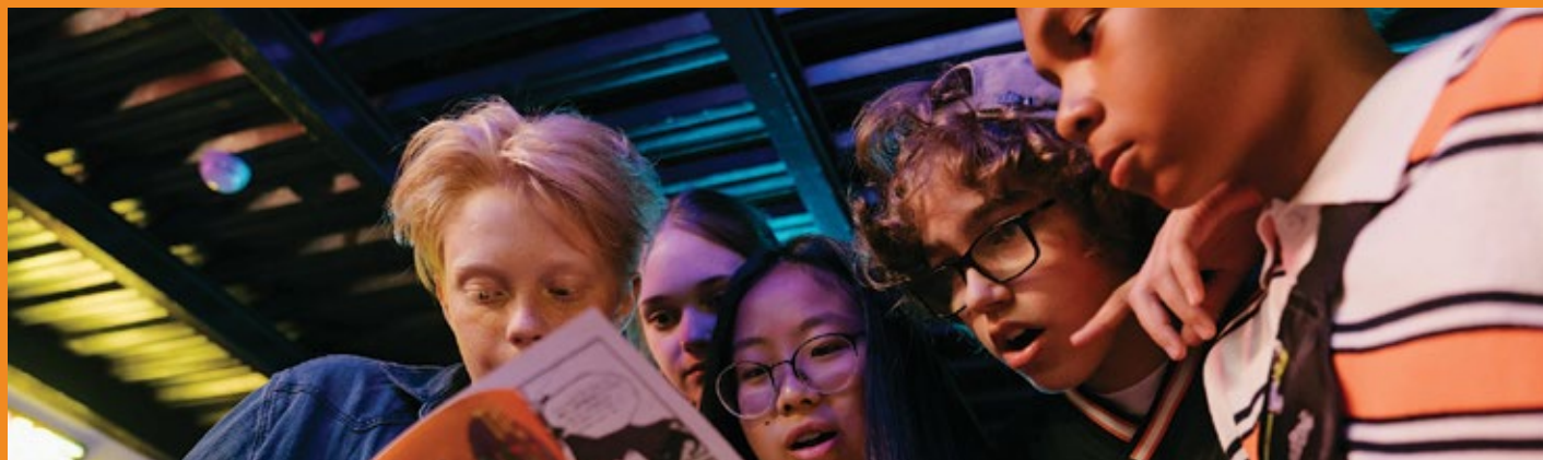
Can we offer you and your school anti-racism support?

We would welcome your feedback and calls for support: what would you like to help you with curriculum content, staff training and community buy-in?