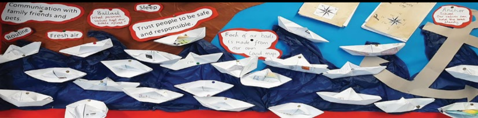
This photo has been kindly shared with us by High Heskett CofE Primary School and is from one of their CARE Afloat displays