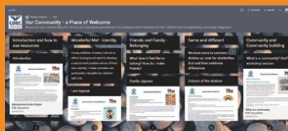
Snapshot of the Our Community - a Place of Welcome toolkit

CDEC has just produced an exciting 'Our Community - a Place of Welcome' online resource kit for nursery and Early Years practitioners to support young children and families who use English as an additional language (EAL). This Padlet is available to any setting here https://bit.ly/PlaceWelcome and has links to Cumbria Early Years (EAL) resources too. The aim is to help young children using EAL become more fluent and ready for school and for parents to feel more integrated into their local community. Please pass on the link!