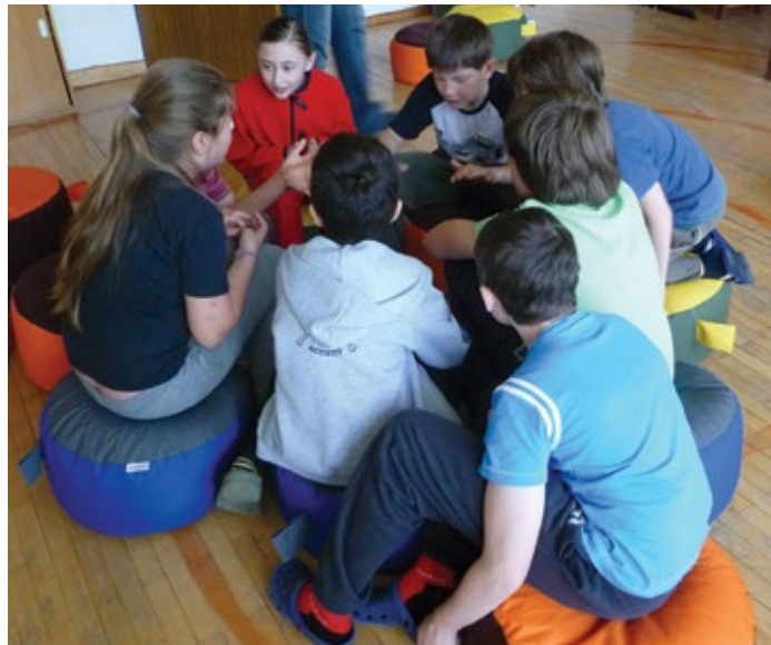
Developing stories is an opportunity for children to work together

For teachers who would like to use storytelling as an effective and engaging way of learning see the Sankofa Learning Guide created by the partners on the website. This will be followed in 2021 by a practical Sankofa Teacher Toolkit with activities and resources for use in the classroom centred around global SDG themes.